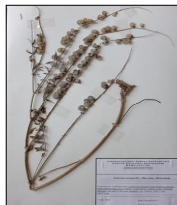
Fig. 4. General view of O. buhseana .