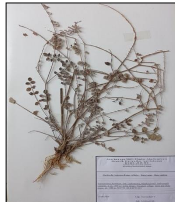
Fig. 3. General view of O. michauxii

and margin covered with hair-like bristles. Inflorescence and fruit ripening occur in May-June. It is found in dry rocky, sloping slopes and deposits of lime in the low and moderate-high belts (Fig. 4).