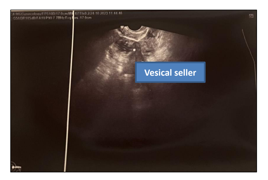
Fig. 2. Ultrasound image of a prolapsed Vesical seller.

Endorectal and transvaginal Ultrasound examinations were performed by us on a multistage basis. On endorectal Ultrasound examination: