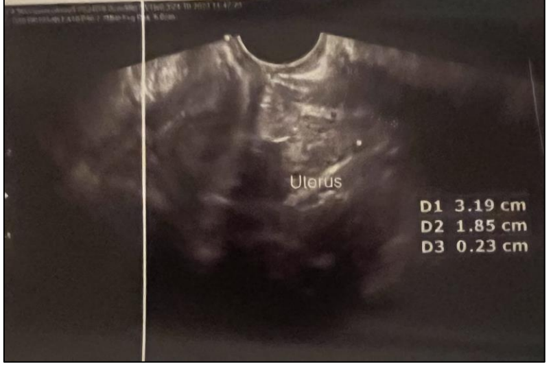
Fig. 1. Ultrasound image of a prolapsed uterus.

of the horizontal axis with the line passing through the support area of the bladder is measured (Fig. 2).